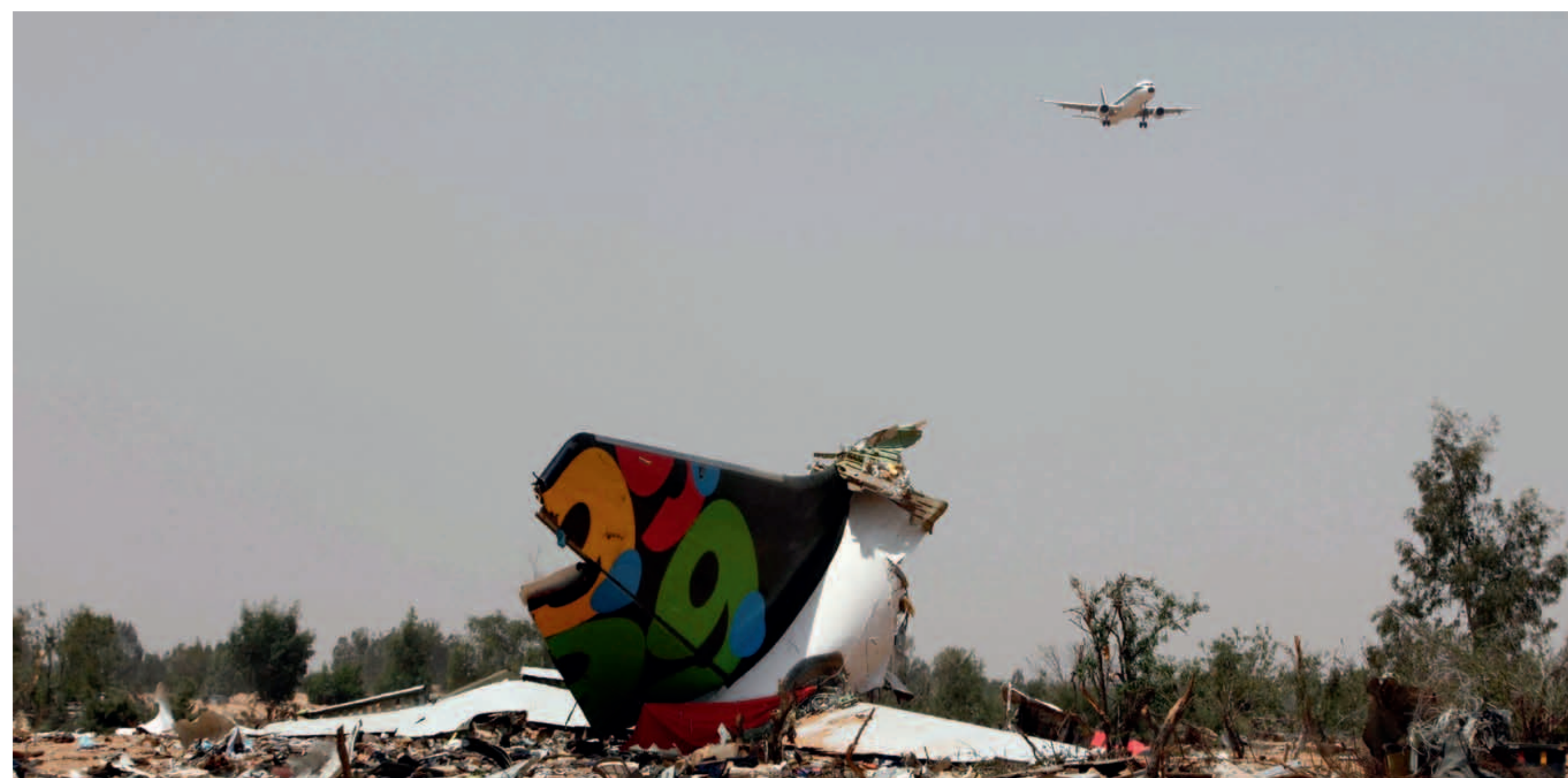
Photo 1. Crash site in Tripoli, Libya.

On May 12 th 2010, Afriqiyah Airways Flight 8U771 crashed upon landing near Tripoli International Airport, Libya, claiming 103 lives and leaving a sole survivor, a young child. The majority of the victims, 70 in all, were Dutch nationals. Among the victims were a number of blood-relatives. Five days after the crash, the Netherlands Forensic Institute (NFI) was formally requested by both the Libyan authorities and the Netherlands Ministry of Foreign Affairs to assist with the Disaster Victim Identification (DVI) process. Bonaparte DVI , a newly developed software package based on Bayesian networks, was used in the screening and matching process.